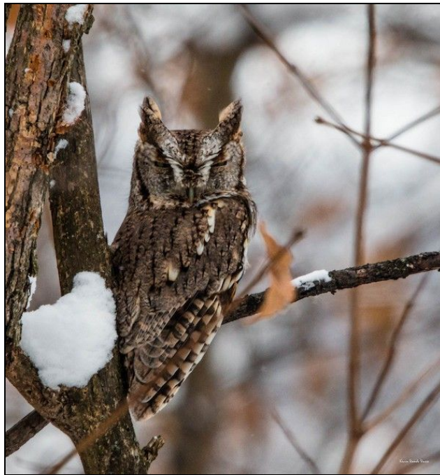
Eastern Screech-Owl by Kevin Vande Vusse