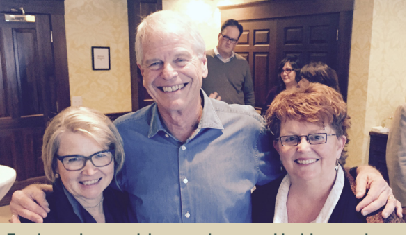
Faculty gather to celebrate at the recent Healthcare cohort reception

has been appointed the American Association of Retired Persons (AARP) State Director for the Virgin Islands. Learn more about his new position here.