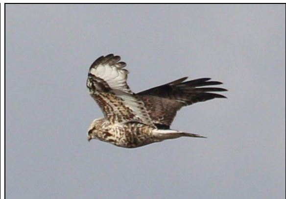
Snowy Owl in flight (left) and a light-morph Rough-legged Hawk (right) kiting in the afternoon wind at Plum Island (Photos by Chad Witko).