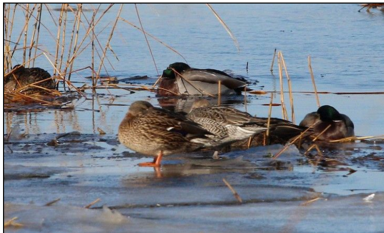
Female Northern Pintail sleeping among Mallards (note grayish body and gray legs).

After our brief stop at Joppa Flats, we quickly made our way to Plum Island and Parker River National Wildlife Refuge just up the road. Hitting the refuge mid-day, we were excited to still find some great birds from Parking Lot 1, including nearby Razorbills and