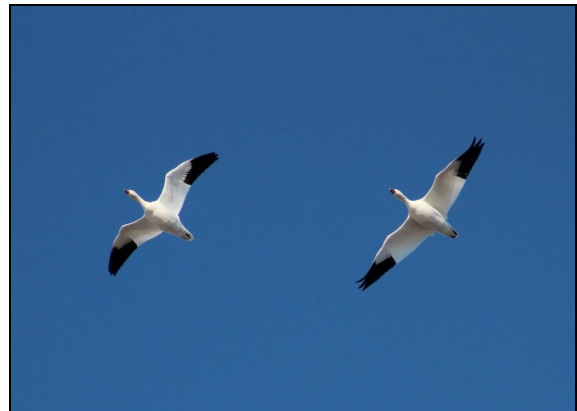
Mixed waterfowl flock (left) and Snow Geese (right)