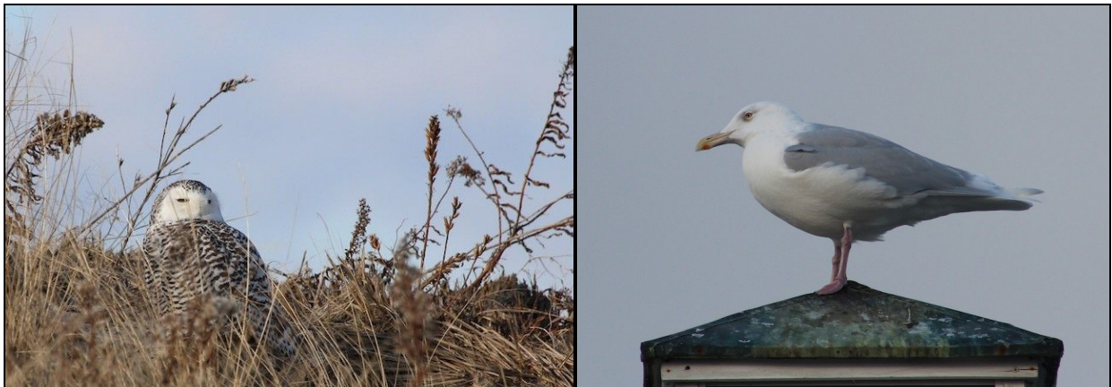
Snowy Owl (left) hanging out in the beach dunes at Hampton Beach State Park, and a Glaucous Gull (right) showcasing its beautiful white wingtips.

Having been following reports of a Glaucous Gull for the past few days, the group decided to head across the road to Yankee Fisherman's Co-Op, near where the gull had been regularly spotted. After looking around, and braving the cooling temperatures, no gull with white wingtips had been spotted. But, just as they were pulling out of the parking lot, Steven asked "Wait, what about that one on the lightpost?" Indeed, there sat the Glaucous Gull! After quickly re-parking, everyone whipped out their cameras and binoculars to get a better look. Many photos were taken as the bird alternatively perched and soared in the wind, sliding in and out of golden rays from the setting sun.