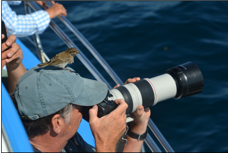
Purple Finch on Pelagic Trip by Rachel Yurchisin